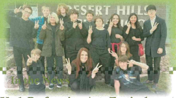
In the News