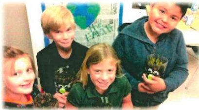
Ms. Metzger's class planted seeds for Arbor Day!